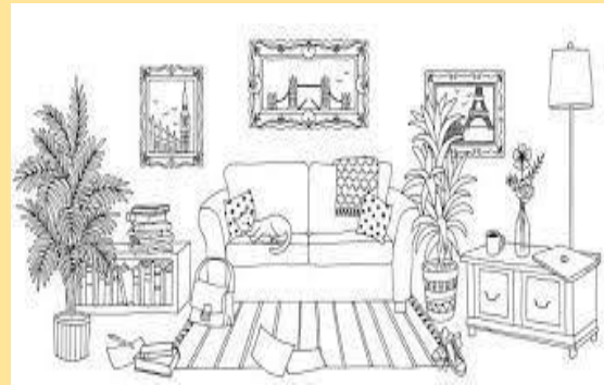
4. Living room We sit here with our guest.

B. Where do you find these things? Write 1 for bedroom, 2 for kitchen, 3 for living room and 4 for bathroom