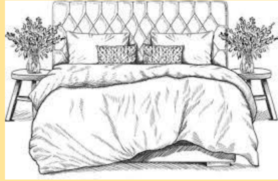
2. Bedroom We take rest here.