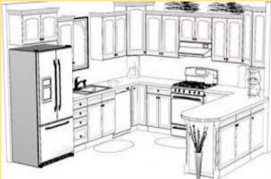
3. Kitchen We cook food here.