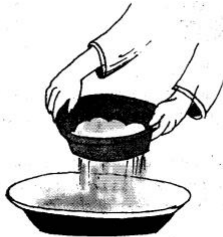
Fig. 5.10 Sieving

Ans. Sieving is a process by which fine particles are separated from bigger particles by using a sieve. It is used in flour mill or at construction sites. In flour mill, impurities like husks and stones are removed from wheat. Pebbles and stones are removed from sand by sieving.