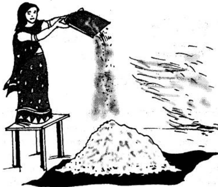
Fig. 5.9 Winnowing

Ans: Winnowing is used to separate heavier and lighter components of a mixture by wind or by blowing air. This process is used by farmers to separate lighter husk particles from heavier seeds of grain.