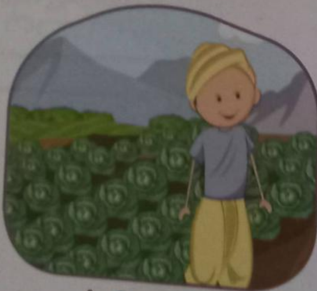
A farmer grows crops.