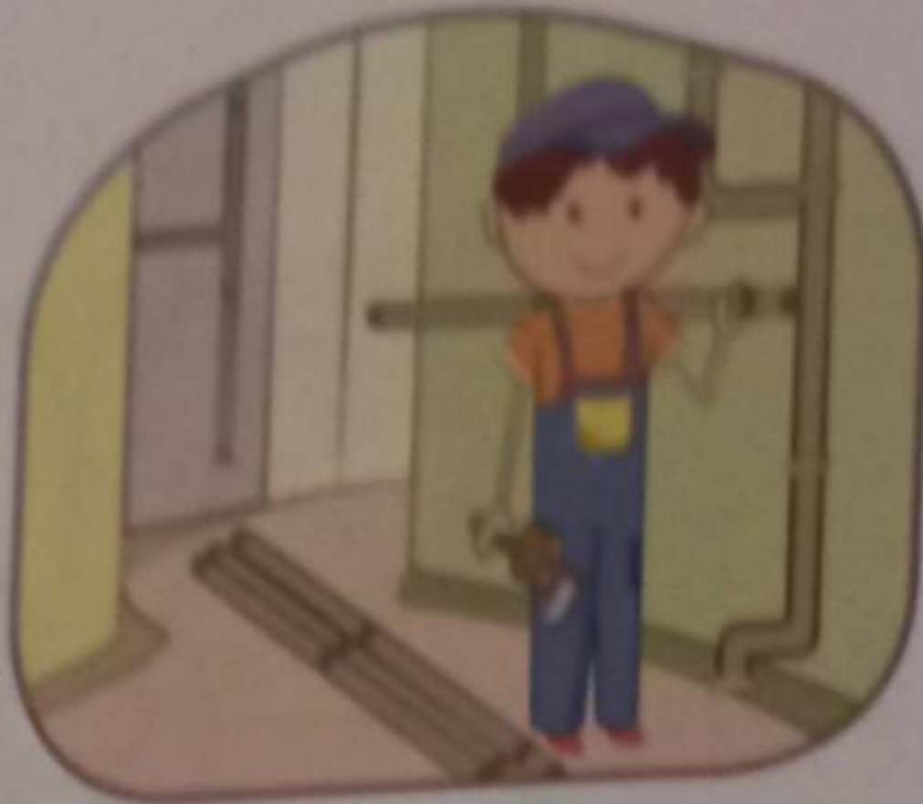
A plumber fixes taps.