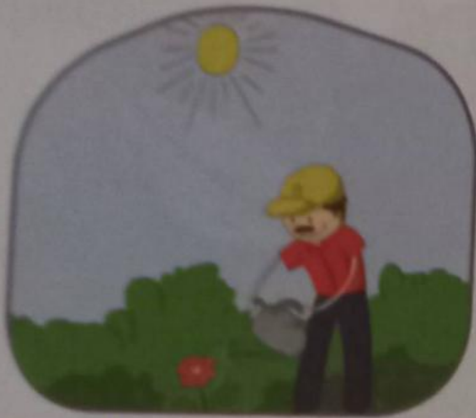
A gardener looks after the plants in a garden.