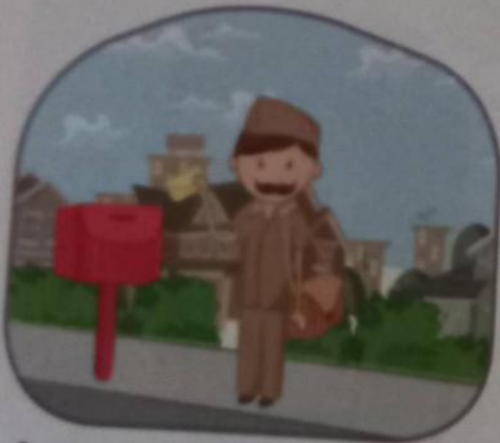
A postman brings you letters.