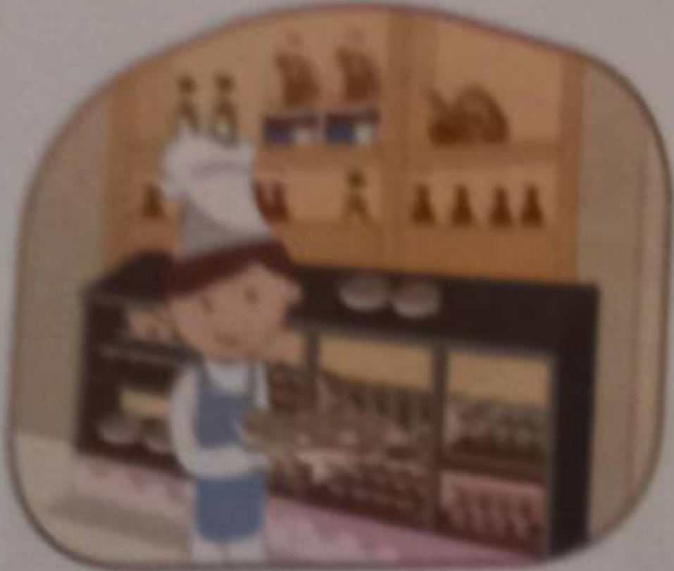
A baker bakes bread and cakes.