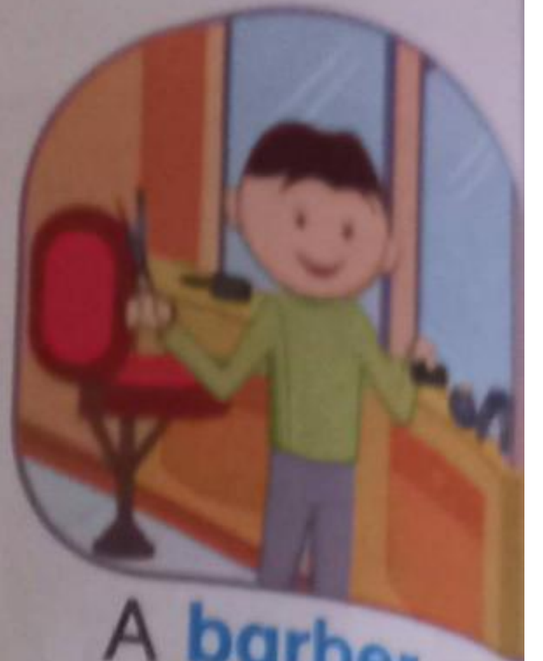
A barber cuts your hair.