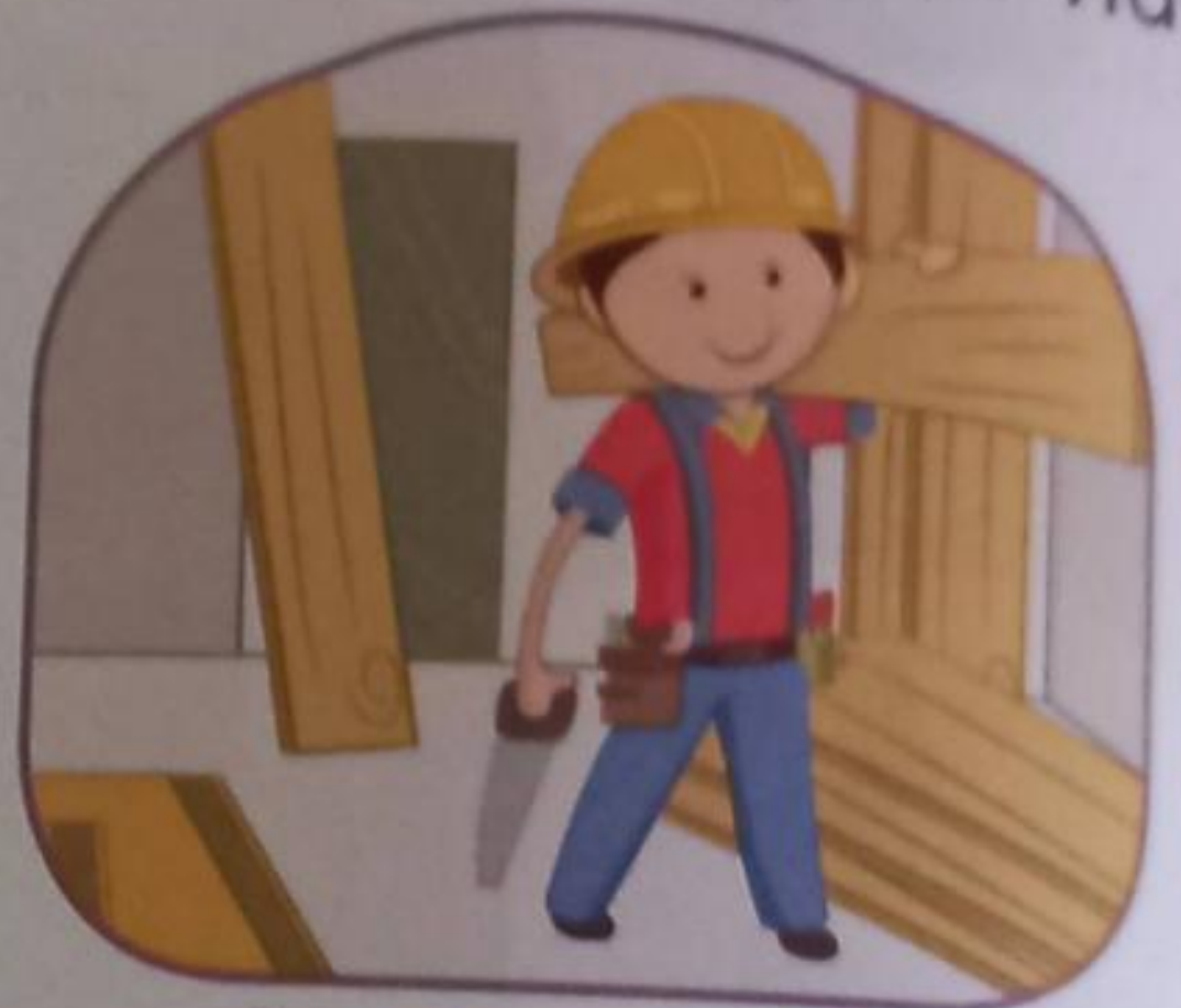
A carpenter makes furniture.