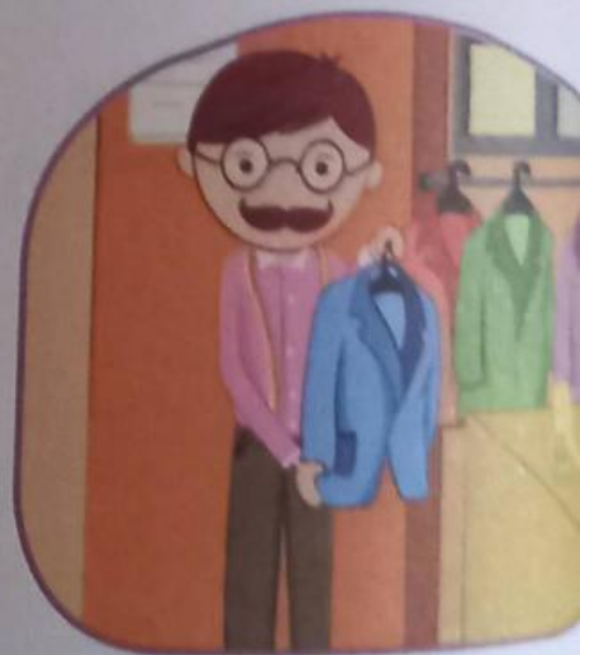
A tailor stitches clothes.