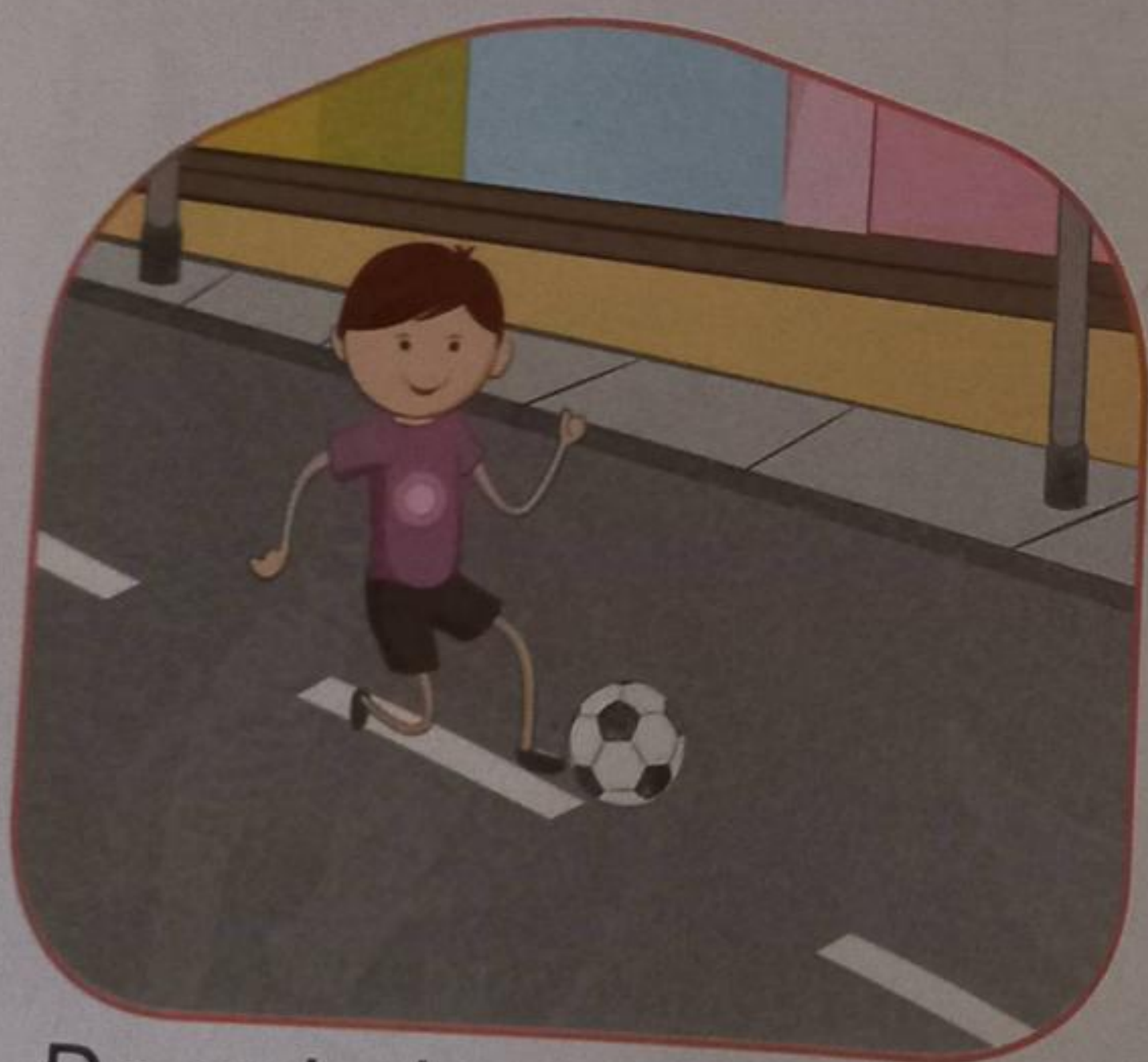
Do not play on the road.