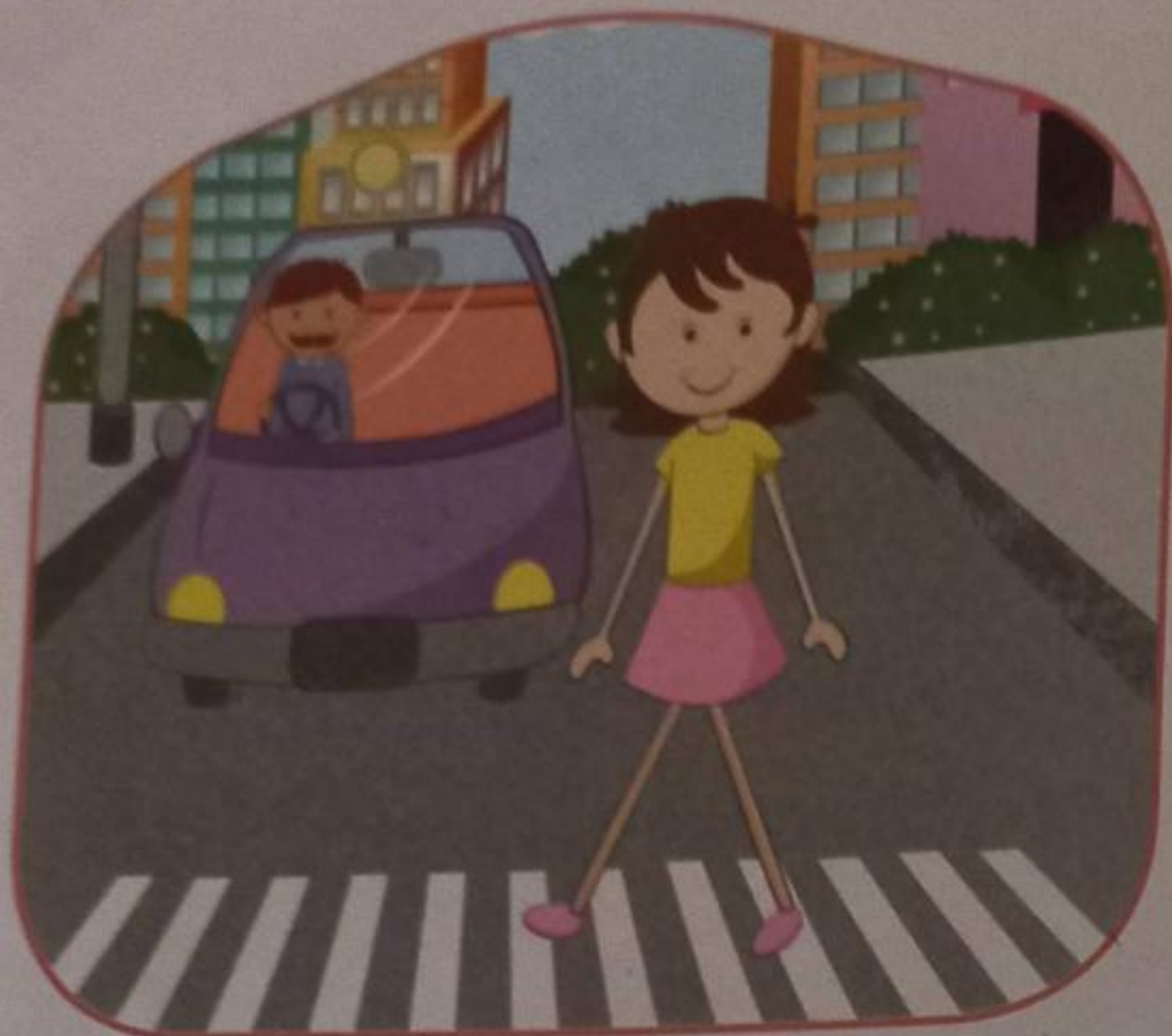
Cross on the zebra crossing .