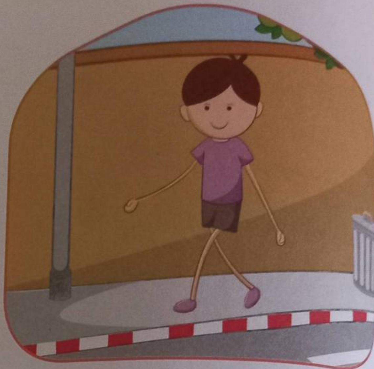
Walk on the pavement .